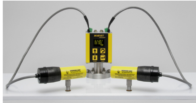
IGM-402 Ionization Gauge with Dual Convection

The first modular Ionization vacuum gauge capable of operating two Convection gauges.